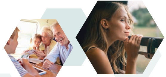
TRAINS AND UNDERGROUND SERVICE

As a matter of fact, bacteria, viruses and generally microbes may be found in transport vehicles, spreading from particles coming from outside with passengers; surfaces and upholstery fabric provide ideal conditions for them to proliferate and spread around. Thus, coming into contact with these items will increase the risk of contagion.