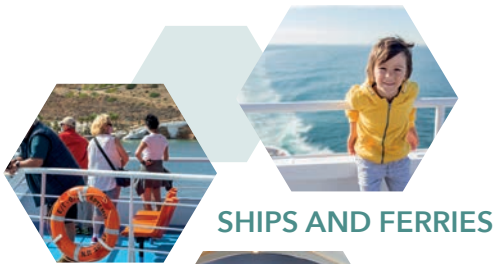
SHIPS AND FERRIES